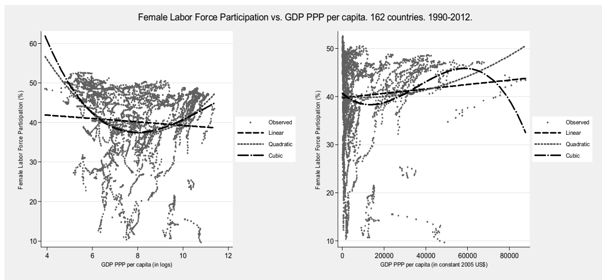
Chart 1. Female Labor Force versus GDP per capita. 162 countries. Period 1990-2012.

bor market remains significantly low, regardless of high GDP per capita. It leads to the general conclusion that changes in female labor force participation are not exclusively attributed by economic growth, but depend on a multitude of factors which are not captured in here.